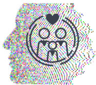
MSS Mental Health Resource

This is a mental health resource that will appear in the E-Bulletin weekly that was created by past and present Markville students.